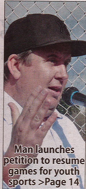
Man launches petition to resume games for youth sports >Page 14