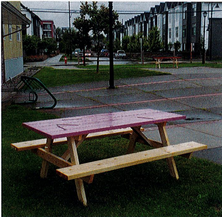
The bright light idea. At a board meeting in

famous when the TV show Supernatural shot their 2nd to last episode “Inherit the Earth” in late Aug. 2020. This was one of the first productions to film in BC after the COVID shutdown the industry. The Cloverdale BIA again in partnership with the City of Surrey was able to borrow four brightly coloured picnic tables that now live in Hawthorne Square across from the Clova. Luckily, there is a small school at the Square.