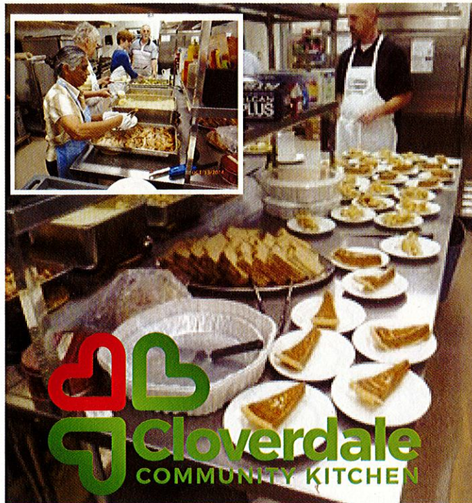
Volunteers in the kitchen preparing a meal.

The Cloverdale Community Kitchen began in 2011 when the City of Surrey and the RCMP approached Pacific Community Church and ask if they would provide meals for the homeless as another organization had closed their kitchen. The first meals were served from a small kitchen and everyone quickly realized a full size commercial kitchen was needed. Through community support and a grant from the Surrey Homelessness and Housing Society a full size commercial kitchen was completed in 2013. Currently they serve