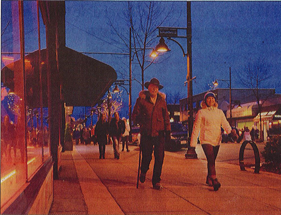
Walkers go past 'Cerberus Books,' a set featured in Netflix's Chilling Adventures of Sabrina series.