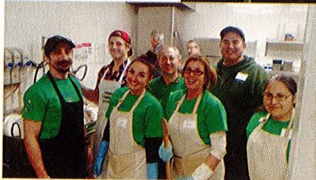
Volunteers in the kitchen preparing Turkey Dinner

expected to brave the cold winter's night. Our current supporters are Katronis Real Estate Team, Cloverdale BIA, Magnum Nutraceuticals, immediate images, MLA: Marving Hunt, and Zinetti Foods. We hope to have all our sponsors confirmed by the end of January.